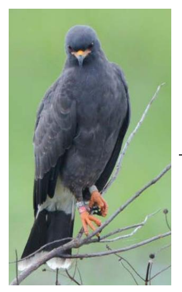
Feeds almost exclusively on