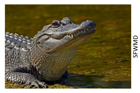
Just a snack

Young alligators love to eat apple snails