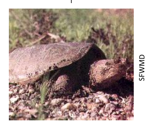
Snapping Turtle (Chelydra serpentina):

Its powerful jaws can give a serious bite