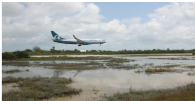
Key West Airport May 7, 2012