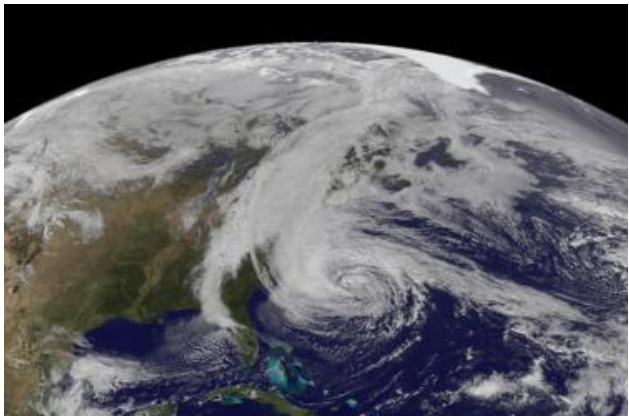
GOES View of Hurricane Sandy

"Climate Science Investigations (CSI): South Florida," is funded by the National Aeronautics and Space Administration (NASA) to develop an online ( www.ces.fau.edu/nasa ) interactive curriculum that uses NASA data to improve climate and science literacy for teachers and secondary students. In the lessons, students conduct research, then develop and deliver an argument regarding current climate change science and misconceptions. Four states have legislation that requires schools to teach the denial of climate change as a valid scientific concept. In a 2009 poll, more than 80% of teachers surveyed dealt with climate change skepticism from students and parents. The interactive, interdisciplinary CSI lessons allow students to conduct their own research using NASA climate data and then come to their own conclusions about the global climate. Students learn to develop a claim and must use scientific evidence to defend their argument regarding the issue of climate change. The scientific research and argumentation skills that the students develop to determine this conclusion are even more valuable than their results.