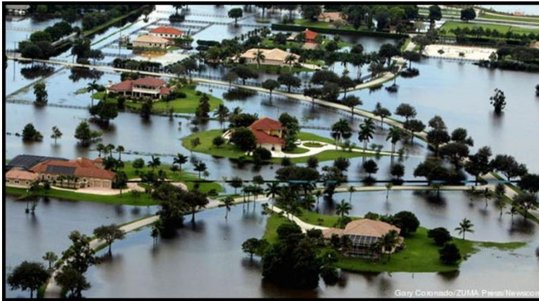
2012 Western Palm Beach County Flooding

Monroe County, which includes the Florida Keys, is very vulnerable to SLR but continues to be proactive. Committees representing different agencies, architects and community groups meet regularly to develop action plans that also include the residential community. They are planning to integrate climate change and SLR into their comprehensive master plans. Examples of their proactive actions include new infrastructure being built two feet above code (although the code has not been changed and it is not yet required) and buildings and infrastructure in Key West must be green-certified. In addition, outreach programs are educating residents how to prepare for impacts of SLR including flooding and storm surge; however, the message is delivered so as not to alarm residents.