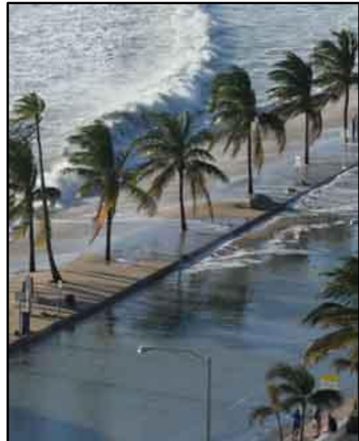
AIA in Ft. Lauderdale Post-Sandy

In the years following back to back hurricanes, insurers, like state-owned Citizens Property Insurance had to step in to subsidize the market so that Florida residents could be insured. There are three main insurance subsidies in Florida: the National Flood Insurance Program, Citizens Coastal Policies Group, and the Florida Catastrophe Fund reinsurance. Insurance is intended for sporadic events, hurricanes, storm surge, not an ongoing issue like SLR. The State of Florida is working on methods to attract private capital and agencies back to provide insurance coverage in the state.