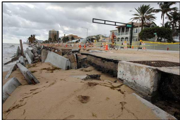
AIA in Ft. Lauderdale Post-Sandy

A recent study for the Florida Department of Transportation identified roads that are vulnerable to sea level rise and brought attention to issues that need to be addressed including the fact that roads in South Florida are often at a low elevation and most of their infrastructure lies below the roadway. The study showed that, in some areas, road base materials will fail from saturation long before sea level rise submerges the roads. In addition, navigable clearance under low bridges and highway drainage will be a concern. Increases in road elevation might adversely impact nearby homes and neighborhood infrastructure improvements may be needed. The cost of rebuilding infrastructure and providing power will dictate which solutions will be pursued and where.